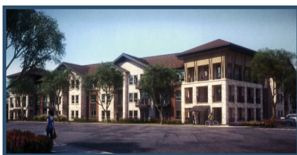
Concept Drawings from the Developer. Final design is yet to be finalized.

While the SNA has traditionally opposed new standard multi-family zoning changes, this is not a normal situation. This site is currently zoned G, high intensity commercial. This type of zoning allows several large non-residential facilities such as the Main Event bowling and gaming center in the Presidio Shopping area. Because of the risk of such G-zoned facilities with their negative impacts on traffic and crime, we conditionally supported building apartments on this land.