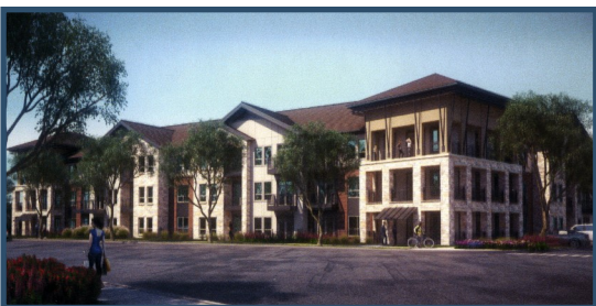
Concept Drawings from the Developer. Final design is yet to be finalized.

While the SNA has traditionally opposed new standard multi-family zoning changes, this is not a normal situation. This site is currently zoned G, high intensity commercial. This type of zoning allows several large non-residential facilities such as the Main Event bowling and gaming center in the Presidio Shopping area. Because of the risk of such G-zoned facilities with their negative impacts on traffic and crime, we conditionally supported building apartments on this land/