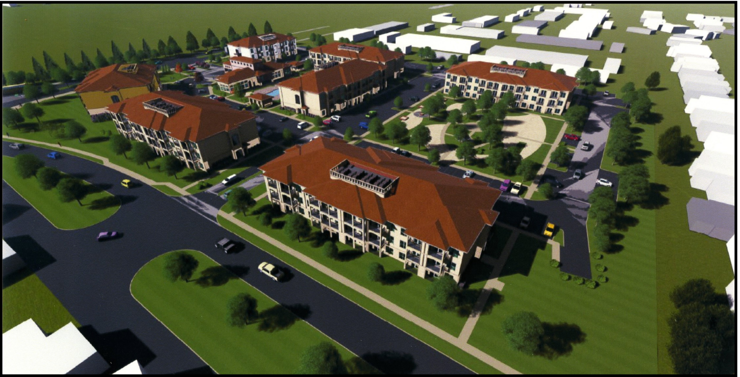
Artists concept for the planned Senior Housing Facility

Over the last few years the SNA has met with several developers wanting to build standard multi-family units on this tract of land, similar to the complex just to the north of this tract. We feel we have too many standard apartment complexes in the area so we have opposed all of these efforts. However, this senior multi-family complex appears to be a good fit for this location without many of the negatives of a standard complex. Commercial facilities such as strip centers generate a lot of car traffic and frequent delivery & dumpster truck traffic which have a high noise impact. The following are the reasons our Board of Directors decided to support this development: